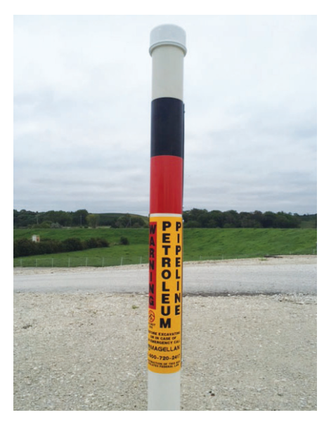
Our pipeline markers can be typically identified by the black and red bands at the top.

Magellan Midstream Partners, L.P., a wholly owned subsidiary of ONEOK, Inc., is principally engaged in the transportation, storage and distribution of refined products and crude oil. Magellan operates a 9,800 mile refined products pipeline system with 54 connected terminals as well as 25 independent terminals not connected to our pipeline system, two marine terminals (one of which is owned through joint venture) and a 2,200 mile crude oil pipeline system.